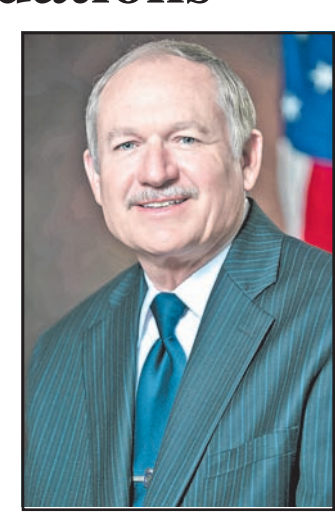
Union County Sheriff Mack Mason

This task force, in partnership with counties, cities See Task Force, Page 2A